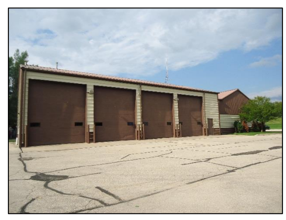
Town of Burke Town Hall and garage.

Dane County's government offices operate out of several buildings located within the City of Madison and throughout the County. The County's Department of Human Services office is located within the City of Sun