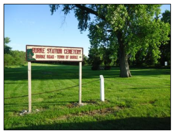
Burke Station Cemetery.

Three cemeteries are within the Town of Burke. The Burke Station Cemetery, also known as the Burke School District Cemetery, is located on Burke Road. This cemetery is included in The Town of Burke Park and Open Space Plan as an area of unplanned open space recommended for preservation. The site was also once home to the Burke Station School which was erected in 1865 and razed in 1993 and is marked by a historical marker.