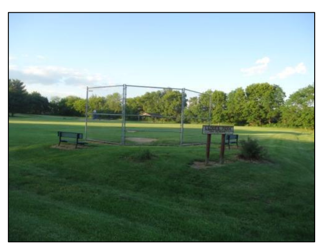
Ledges Park. Photo courtesy Mead & Hunt, Inc., 2013

The Park and Open Space Plan identified eight Neighborhood Parks including one mini-park and one neighborhood play area. A neighborhood park is designed to provide both active and passive recreation activities to populations living within one quarter mile. Neighborhood parks are located within neighborhoods but because of this, they can be difficult for visitors to locate and utilize. Signage of parks