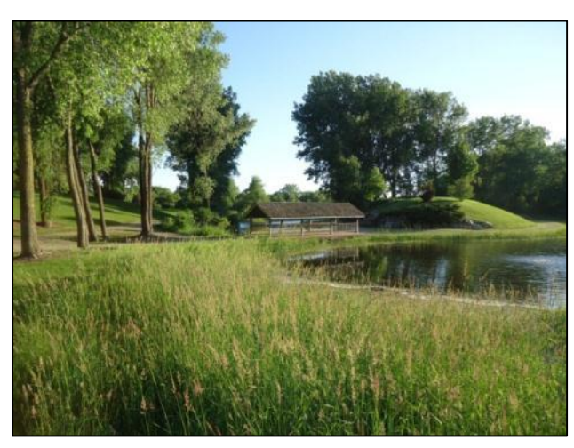
Burke Town Hall Park.

Burke Town Park is located to the southwest of the intersection of Nelson Road and Reiner Road, adjacent to the Burke Town Office. This park is attractive and unique and provides local recreational opportunities like fishing, mushroom gathering and hiking. The park includes a picnic area and shelter, playground, and horseshoe pit and is accessible to the public or available for reservation. A popular spot for a photo opportunity, the parks identifying feature is a peninsula surrounding by a catch and release fishing pond. Town Hall Park is a protected area