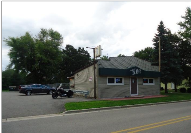
The Keg Steakhouse and Bar, located on Portage Road, is listed among the DeForest Area Tourism Commission dining options within the Town of Burke.

The DeForest Area Chamber of Commerce promotes economic and community development in the Village of DeForest and surrounding towns, including Burke. Balancing residential and business growth