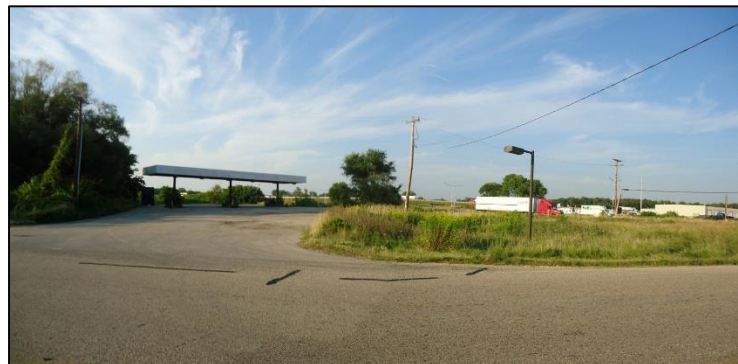
This former gas station near the interchange of Interstate 39/90/94 and US Highway 51 presents an opportunity not only for economic development but also for remediation of a brownfield.

The WDNR Environmental Remediation and Redevelopment Program maintains a list of contaminated sites, or “brownfields,” in the state. The WDNR defines brownfields as abandoned, idle, or underused commercial or industrial properties, where the expansion or redevelopment is hindered by real or perceived contamination. Brownfields vary in size, location, and past use, but can be anything from a 500-acre automobile assembly plant to a small, abandoned gas station. These properties present public health, economic, environmental, and social challenges to the communities in which they are located. In Wisconsin there are an estimated 10,000 brownfields.