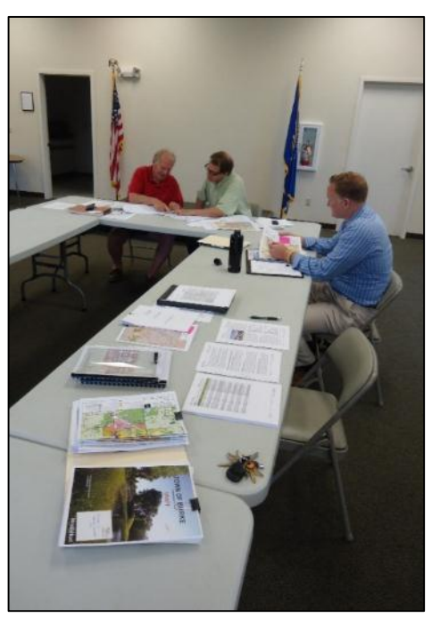
The Town of Burke Comprehensive Plan Steering Committee

The Smart Growth legislation also outlines specific procedures for public participation that must be