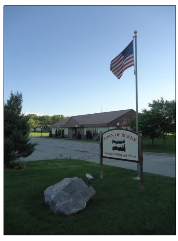
Town of Burke Town Hall.

The beautiful countryside of Burke is rich with productive farmland. Generations of Burke families have enjoyed the quiet rural character and strong sense of community found here. However, the Town's population has been increasing steadily, presenting both opportunities and challenges. Economic growth has provided local employment opportunities, urban amenities, and a larger, diversified tax base. However, as population increases, so does the need for services to keep pace with growth and changing demands. In addition, growth brings with it additional pressure on the existing resource base that is necessary to sustain and improve the quality of life for future residents. In this context, it is essential to plan for development in a