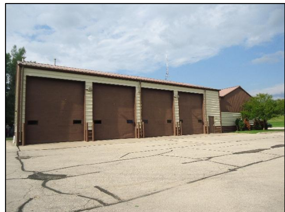
Town of Burke Town Hall and garage.

The Town of Burke Town Hall and offices is located at 5365 Reiner Road. The Town’s public works staff also operates a garage out of this facility. This location has been identified as a Protected Area within the Cooperative Plan.