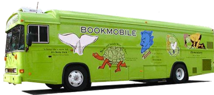
The Dane County Library Service Book Mobile.

Access to Dane County libraries is most readily available through the DeForest Public Library, the Sun Prairie Public Library, or the Lakeview, Hawthorne, or Pinney Branches of the Madison Public Library. The Bookmobile, a mini-library on wheels serving Dane County since