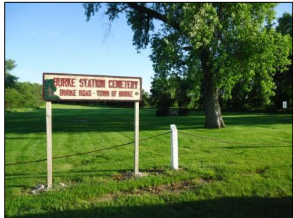
Burke Station Cemetery.

There are 3 cemeteries within the Town of Burke. The Burke Station Cemetery, also known as the Burke School District Cemetery, is located on Burke Road. This cemetery is included in The Town of Burke Park and Open Space Plan as an area of unplanned open space recommended for preservation. The site was also once home to the Burke Station School which was erected in 1865 and razed in 1993 and is marked by a historical marker.