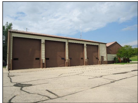
Town of Burke Town Hall and garage.

The Town of Burke Town Hall and offices is located at 5365 Reiner Road. The Town's public works staff also operates a garage out of this facility. This location has been identified as a Protected Area within the Cooperative Plan.