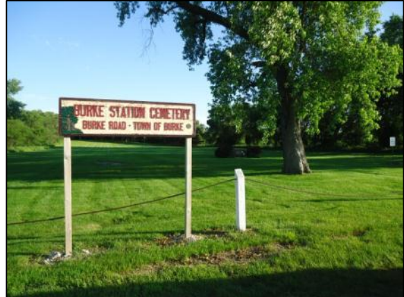
Burke Station Cemetery.

Three cemeteries are within the Town of Burke. The Burke Station Cemetery, also known as the Burke School District Cemetery, is located on Burke Road. This cemetery is included in The Town of Burke Park and Open Space Plan as an area of unplanned open space recommended for preservation. The site was also once home to the Burke Station School which was erected in 1865 and razed in 1993 and is marked by a historical marker.