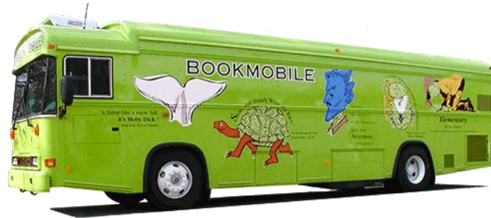
The Dane County Library Service Book Mobile. http://www.scls.lib.wi.us/dcl/bookmobile

Access to Dane County libraries is most readily available through the DeForest Public Library, the Sun Prairie Public Library, or the Lakeview, Hawthorne, or Pinney Branches of the Madison Public Library. The Bookmobile, a mini-library on wheels serving Dane County since 1967, makes weekly visits to cities, towns, and villages that do not have a public library. The closest Bookmobile stop for Town residents is located near the Windsor Elementary School on Windsor Road.