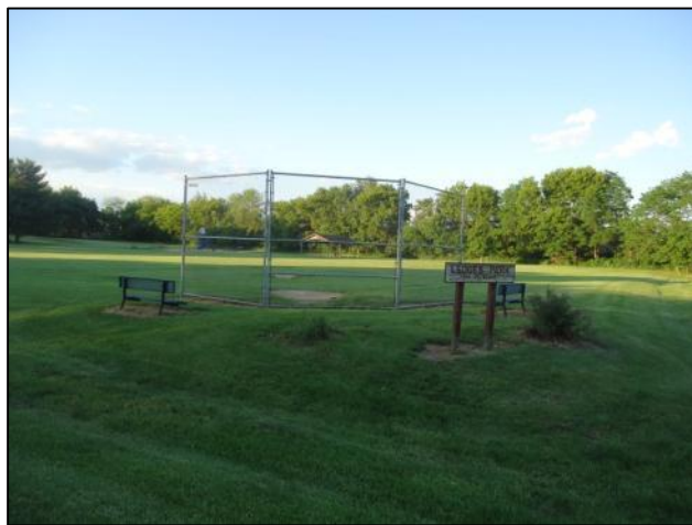
Ledges Park. Photo courtesy Mead & Hunt, Inc., 2013

The Park and Open Space Plan identified eight Neighborhood Parks including one mini-park and one neighborhood play area. A neighborhood park is designed to provide both active and passive recreation activities to populations living within one quarter mile. Neighborhood parks are located within neighborhoods but because of this, they can be difficult for visitors to locate and utilize. Signage of parks