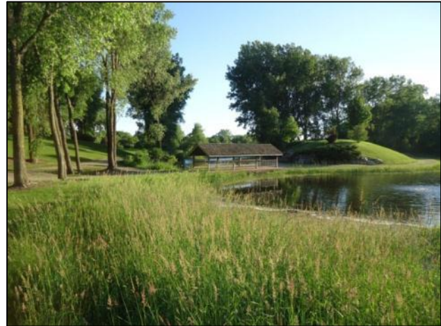
Burke Town Hall Park.

Burke Town Park is located to the southwest of the intersection of Nelson Road and Reiner Road, adjacent to the Burke Town Office. This park is attractive and unique and provides local recreational opportunities like fishing, mushroom gathering and hiking. The park includes a picnic area and shelter, playground, and horseshoe pit and is accessible to the public or available for reservation. A popular spot for a photo opportunity, the parks identifying feature is a peninsula surrounding by a catch and release fishing pond. Town Hall Park is a protected area in Burke and further programming and development of this park will play a significant role in establishing the Towns legacy.